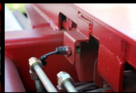
Cabin Lock Sensor